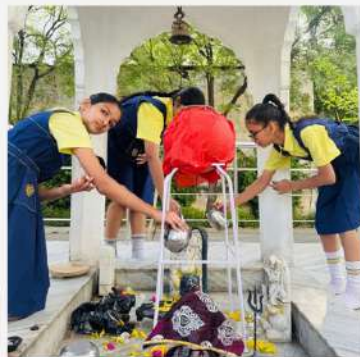
Petals Seeking Divine Blessings as the School Reopens..